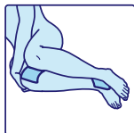
Knees & Ankles